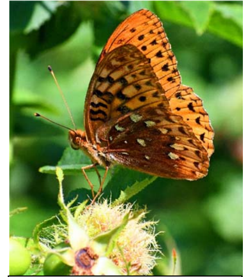
Great Spangled Fritillary

Each year the Washington Butterfly Association offers three Idie Ulsh Young Naturalist Scholarships for our annual Butterfly Study Weekend. Each scholarship covers registration fees, lodging for two nights (this year lodging is in Dayton, WA), meals, and round-trip mileage from home to the venue for a 10-17 year old nature enthusiast and an accompanying parent or guardian. The only requirement is you have to be a resident of Washington, Oregon or Idaho. It is a chance to enjoy butterflies with people who know and love them. This year the Study Weekend will take place July 10-12 th , 2020, in a variety of habitats in the Blue Mountains of Southeast Washington.