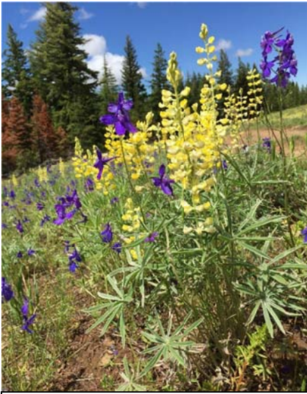
Yellow Lupine – Blue Mountains